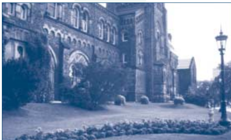
University College, University of Toronto