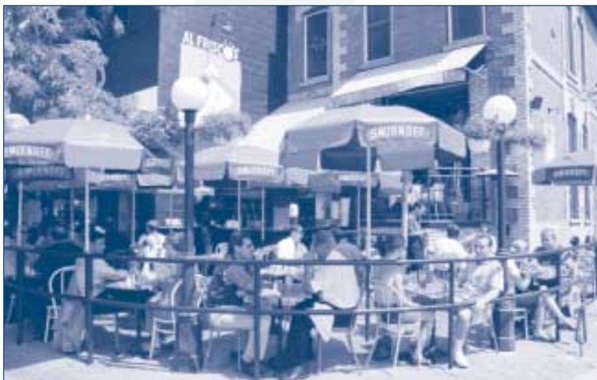
One of Toronto's numerous outdoor cafes.

The Conjoint Committee on CME, an ad hoc group comprising 15 medical/educational organizations, has defined a vision of CME, and with that vision as its guide has established a rationale and recommendations to reposition CME as we know it today. These recommendations suggest a road map for action (building from the existing system) and set the stage for implementing change.