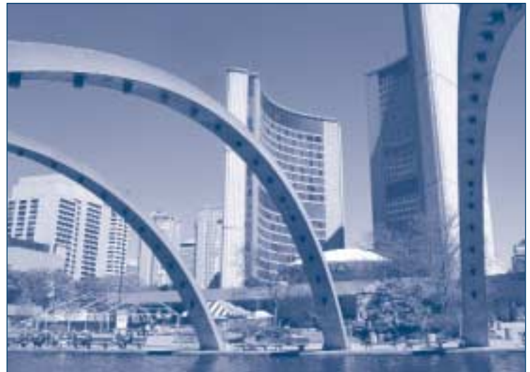
Toronto City Hall and Nathan Phillips Square

This interactive workshop, based on the Institute for Work & Health's experience with rehab professionals, will demonstrate how to develop a knowledge transfer strategy using opinion leaders .