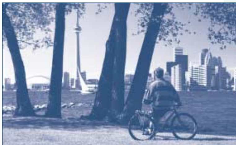
9 Toronto's harbourfront skyline as seen from Toronto Island.

Come and enjoy Toronto's ethnic diversity through its cuisine: a Greek "Taste of the Danforth", a selection of Italian favourites from St. Clair Avenue, East Indian delicacies from Gerrard Street, and much, much, more!