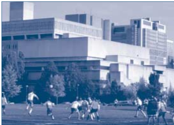
The Medical Sciences Building, University of Toronto

Gain knowledge and awareness about the need to contextualize and translate knowledge and develop your skills in the design of specialist to generalist CME.